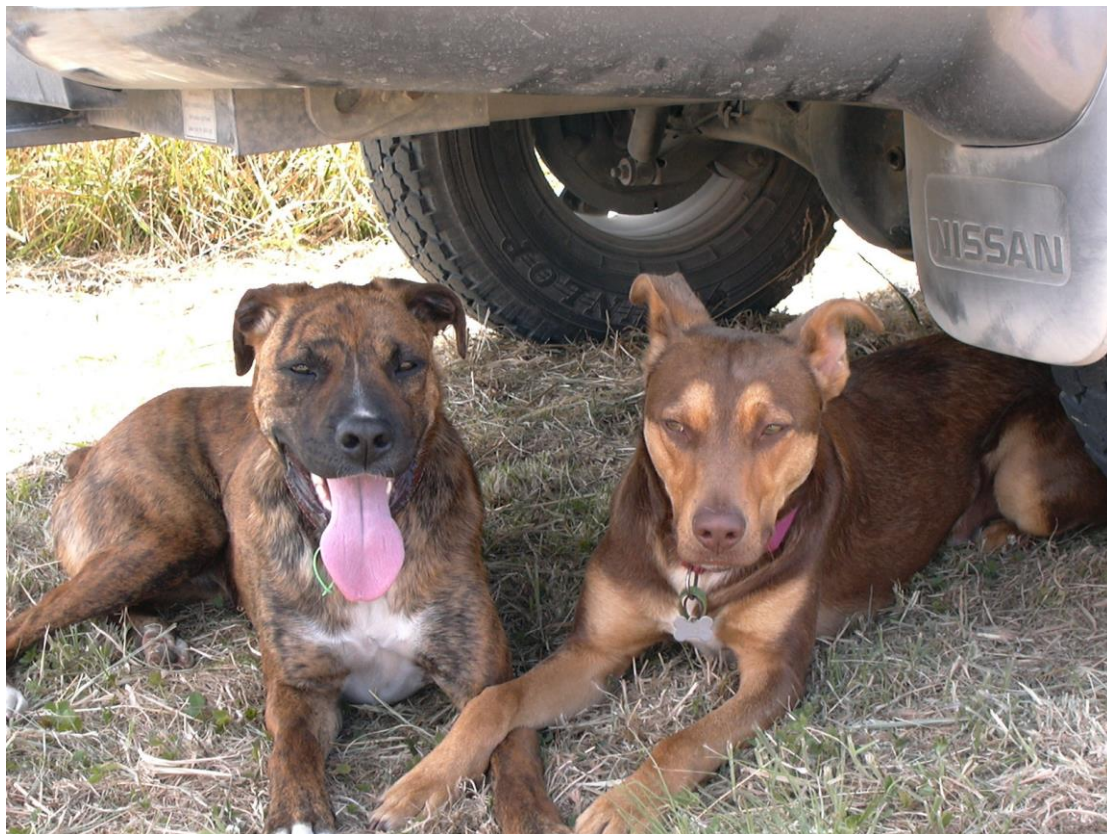
Tramp and Leo